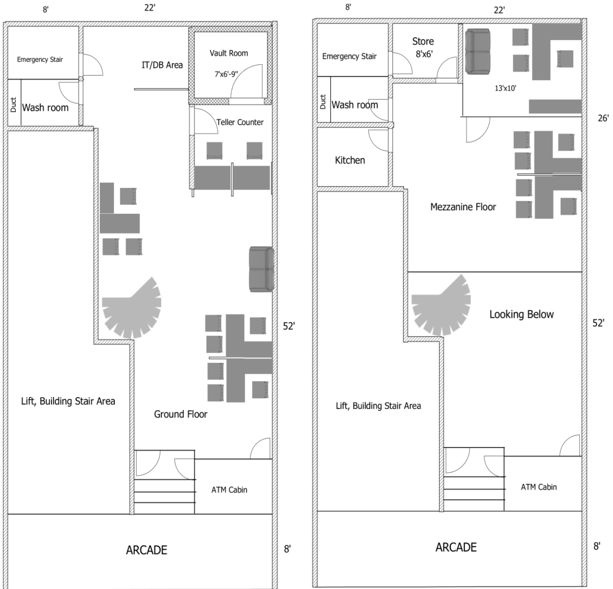
PROPOSED DHA Phase V Branch Lahore